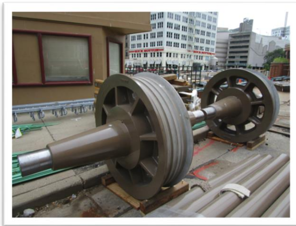
Rehabilitated mechanical components ready for installation