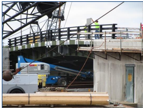
New bridge railing