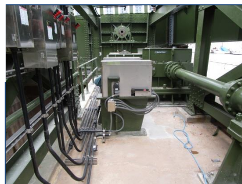
New operating equipment at south pier