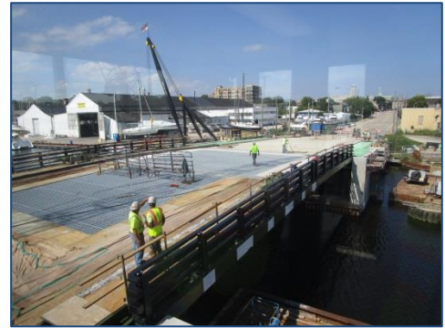
Overview of bridge showing new concrete and steel grid bridge deck