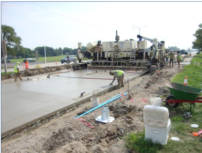
Crews paving the southeast quadrant of E. Layton Ave. and S. Howell Ave.