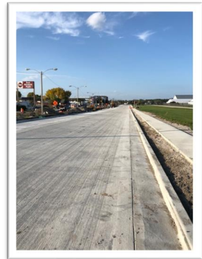
Photo of the newly reconstructed roadway, curb and sidewalk