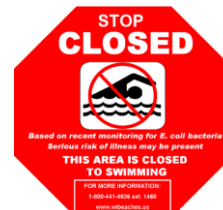
Red Placard: Swimming not advised

Water at Milwaukee’s Bradford, McKinley, and South Shore beaches is tested from Memorial Day through Labor Day weekend. Water samples are analyzed by both the City of Milwaukee Health Department Public Health Laboratory and Zilber School of Public Health Environmental Laboratory for a variety of factors, including microbial contaminants that may indicate potential health risks. Public advisories are posted within 24 hours of collection.