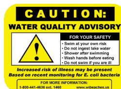
Yellow Placard: Risk of illness elevated