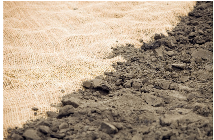
Geotextile matting protects bare soil from erosion caused by wind and stormwater.

Design engineers should use woven geotextiles where impermeability is important, such as for silt fences or