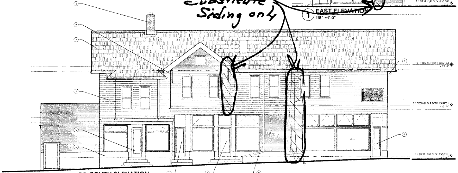
1 SOUTH ELEVATION 1/8" = 1'-0"