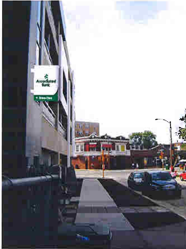
NOTE: 17'-6" From Grade to bottom of flag sign.