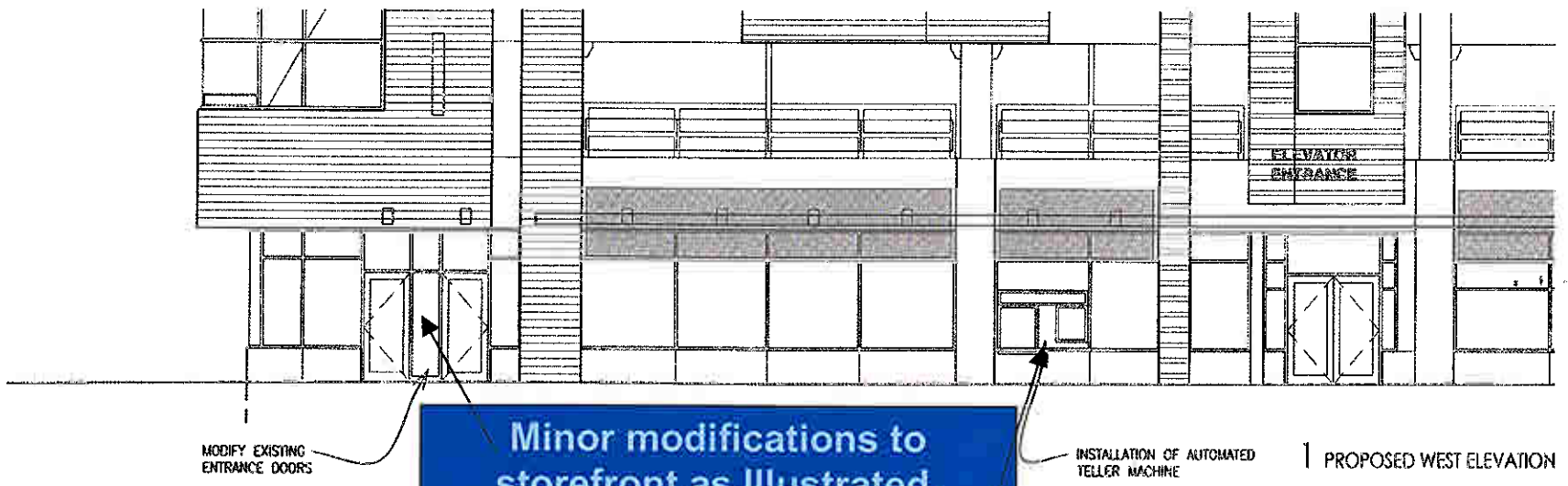
1 PROPOSED WEST ELEVATION

Minor modifications to storefront as illustrated.