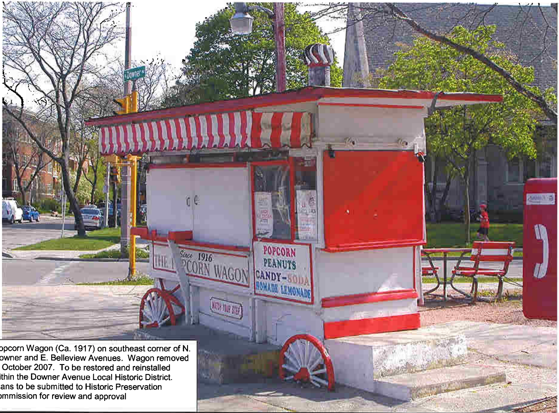
Popcorn Wagon (Ca. 1917) on southeast corner of N. Downer and E. Bellevue Avenues. Wagon removed in October 2007. To be restored and reinstalled within the Downer Avenue Local Historic District. Plans to be submitted to Historic Preservation commission for review and approval