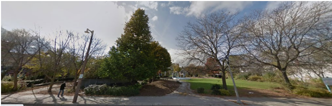
2615-43 N. Martin Luther King Jr. Drive