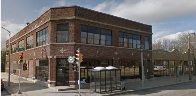
2601-03 N. Martin Luther King Jr. Drive