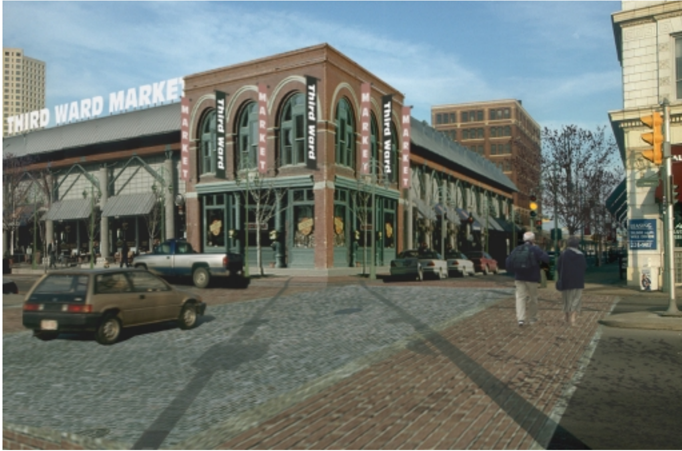
Concept illustration of the Public Market, St. Paul and Water Streets