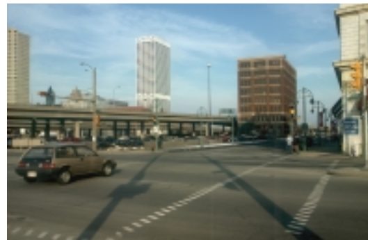
Existing Condition, St. Paul and Water Streets