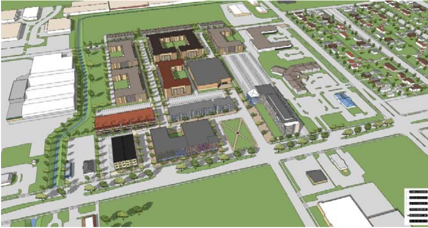
Looking south from Layton Ave. between 3 rd and 6 th Sts.