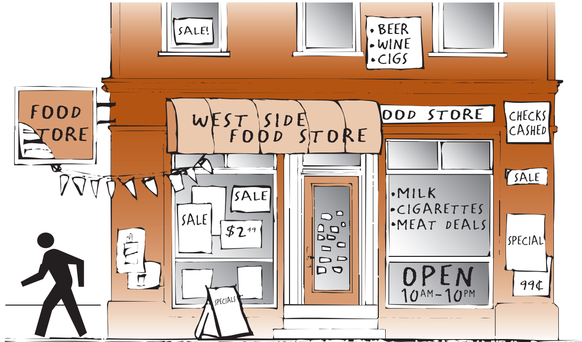
Too many signs give customers an impression of clutter and disorganization.

H ow do you make sure customers know your business exists? Most businesses answer that question with one word: signs. They know signs promote awareness of their business name, products, hours, and special features that attract an impulse shopper.