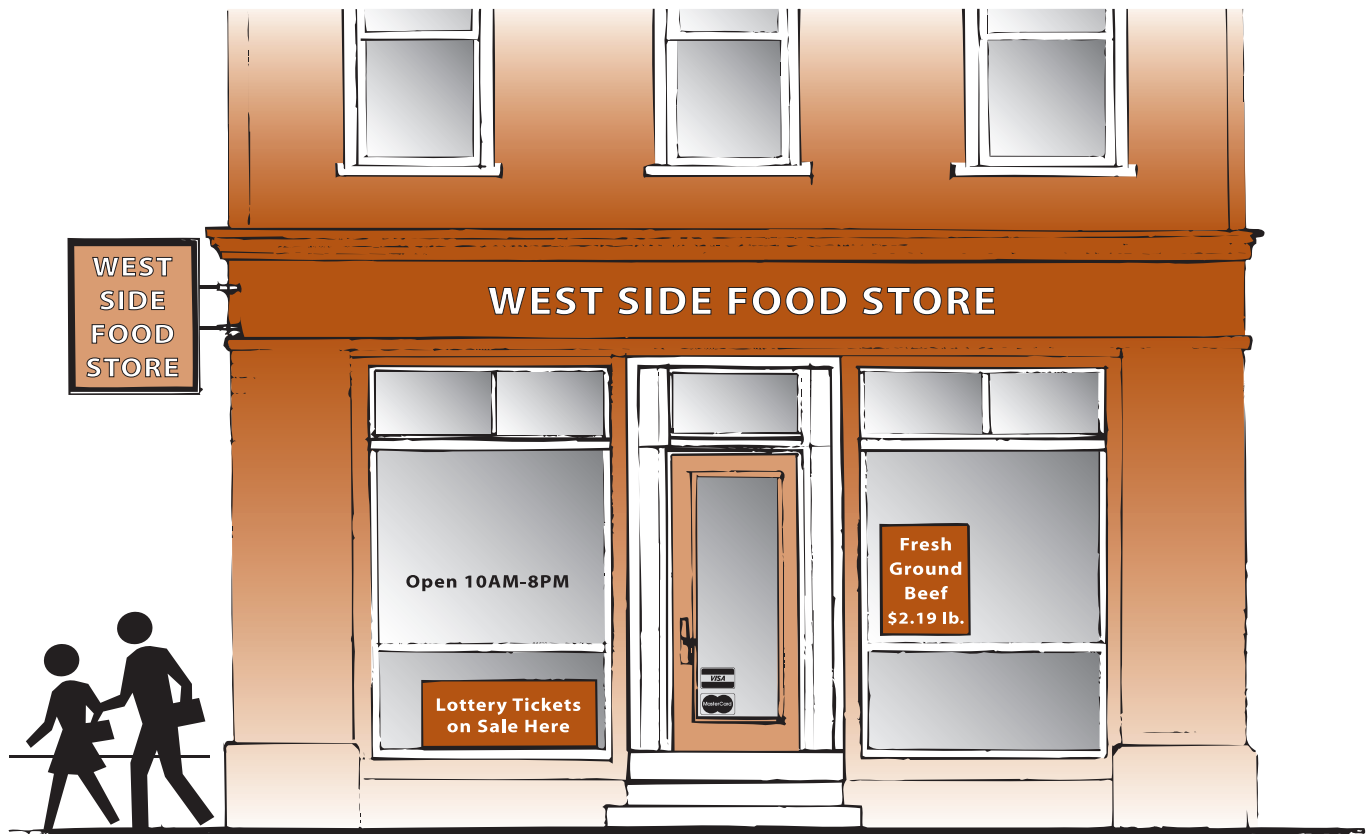
Minimal signage gives customers an impression of organization and provides clear messaging.

For more information, contact the Facade Grant hotline at (414) 286-8201, email FacadeGrants@milwaukee.gov or visit www.milwaukee.gov/facadegrants .