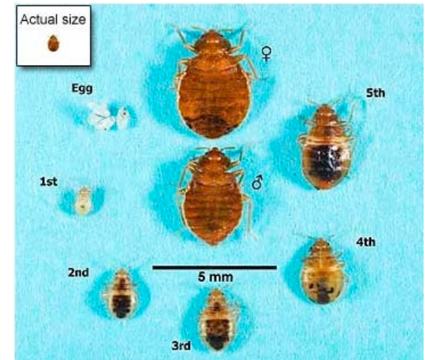
Life cycle of the bed bug, starting from the top left, moving counterclockwise: eggs (1mm), 1st stage nymph (1.5 mm), 2nd stage nymph (2 mm), 3rd stage nymph (2.5 mm), 4th stage nymph (3 mm), 5th stage nymph (4.5 mm), unfed adult (5.5 mm) and fed adult.

One of the sure kill methods for severe infestation is to do a "thermal remediation". This process involves heating the room to 114 degrees for a period of one hour. This process literally dries out the adults and their eggs for a complete extermination. The down side is that it is costly. It is approximately $1,000 - $6,000 per home. The up side is belongings stay in place and only things that melt need to be removed. In one shot it is done, not weeks.