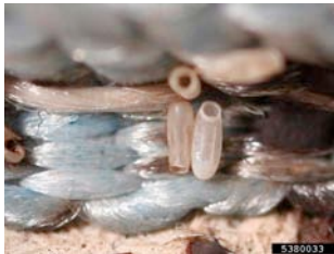
Egg sack of a bed bug.

Except for the “thermal” option, most chemical applications will kill the adults and immature bugs in a few hours. The eggs may not be in contact with the