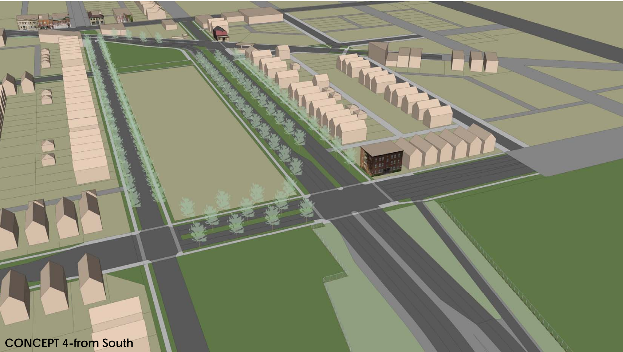
CONCEPT 4-from South