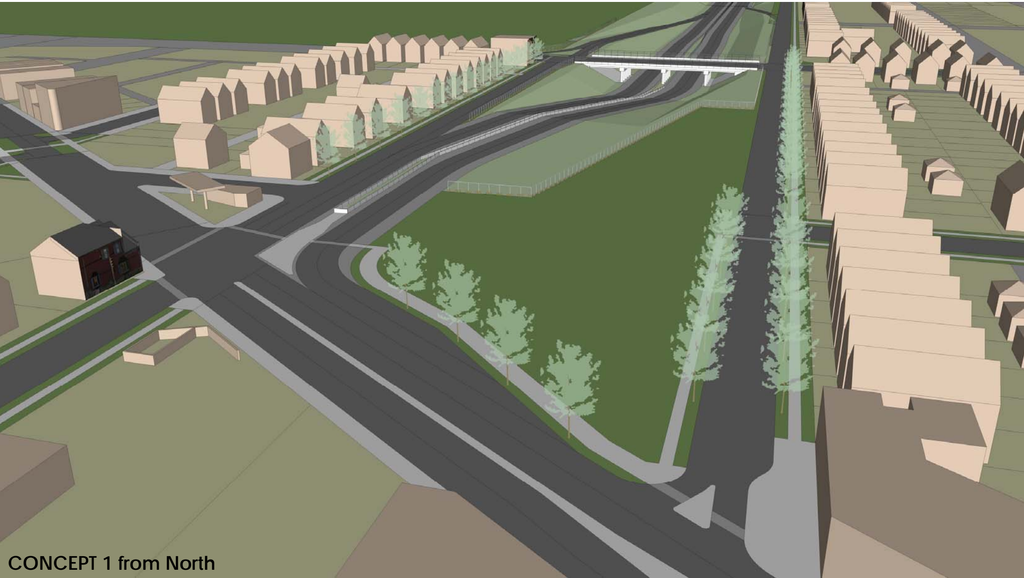
CONCEPT 1 from North