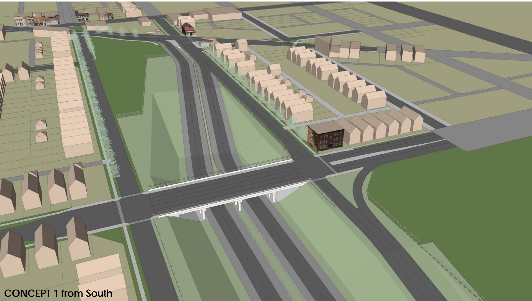
CONCEPT 1 from South