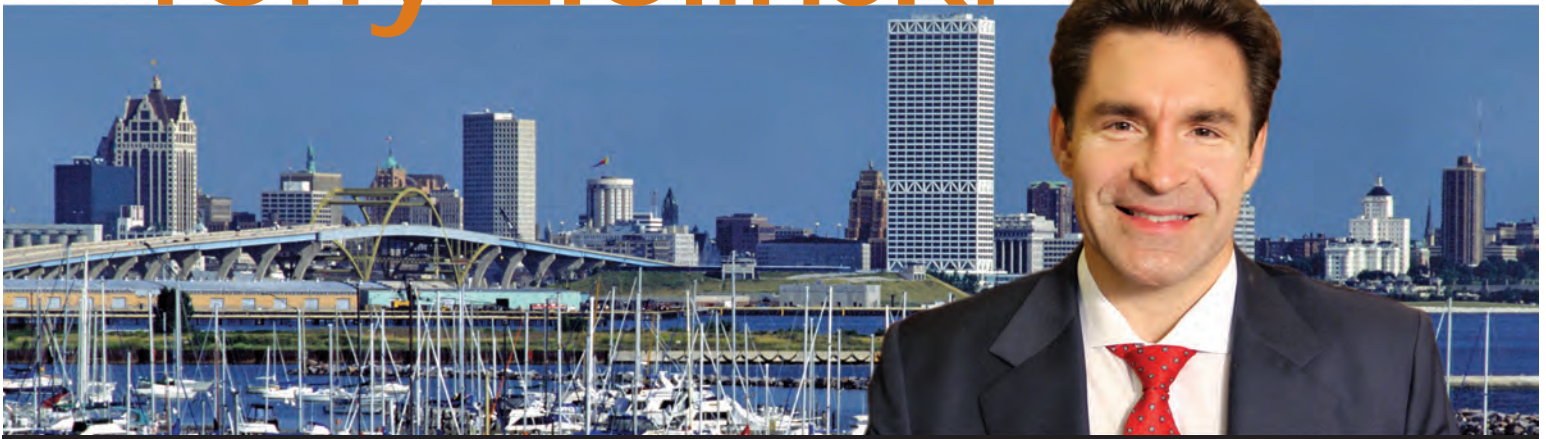
The View From Milwaukee's 14th District