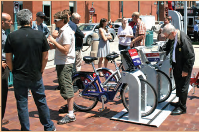
Earlier this summer, bike-sharing equipment was on public display at Catalano Square in the Historic Third Ward.